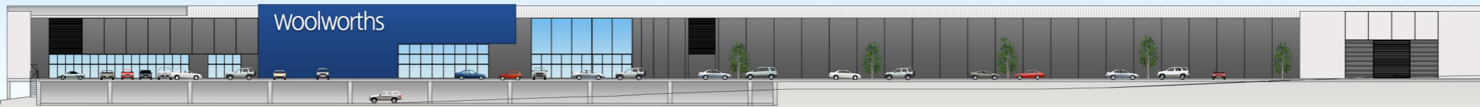
PROPOSED OXYGEN BUILDING STORAGE KING LOWER GROUND LEVEL