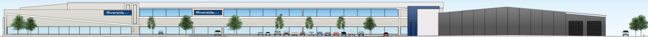
RIVERSIDE STAGE2 BULKY GOODS / COMMERCIAL OFFICE / HI-TECH INDUSTRIAL